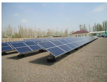
Solar power plant power 130 kW (area Pap, Namangan )