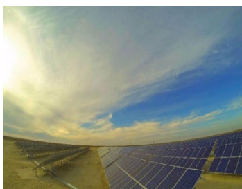
Solar power plant with capacity 1.2 MW (area Karakul, Bukhara)