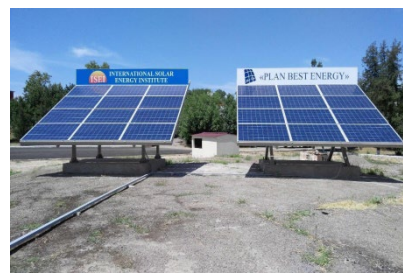
Sfes power 27 kW (Ltd. "International institute solar energy")